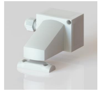
Magnetic door micro-switch